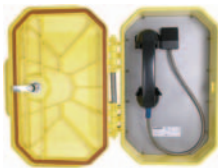
WTR-41 VoIP — Ringdown & Armored Handset Cord