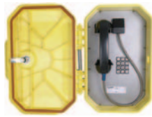
WTT-40 VoIP — Metal Keypad & Armored Handset Cord