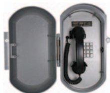
ACT-30 VoIP — Metal Keypad & Curly Handset Cord

ACT VoIP and ACR VoIP Telephones meet the demanding requirements of sites that are prone to abuse and inclement weather. Housed in a locking or non-locking aluminum enclosure they are resistant to moisture dust and corrosive chemicals. Specially designed for outdoor environments.