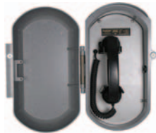
ACR-11 VoIP — Ringdown Telephone & Curly Handset Cord