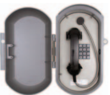
ACT-40 VoIP — Metal Keypad & Armored Handset Cord