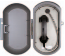
ACR-41 VoIP — Ringdown Telephone & Armored Handset Cord